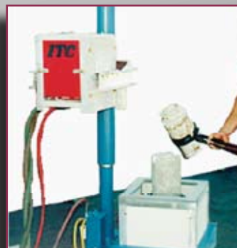
replaceable crucible pedestal included